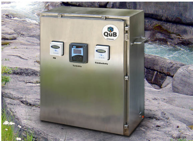
The Water Quality QuB Monitoring System by Eyasco.