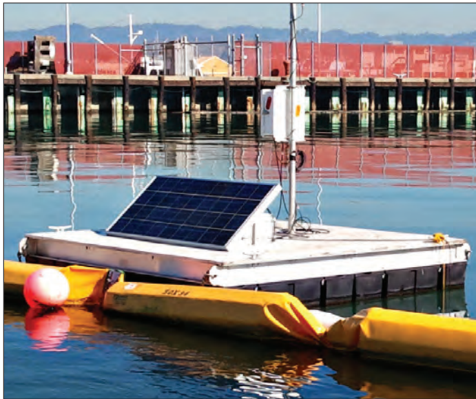
WQ-PAD deployed in San Francisco Bay.