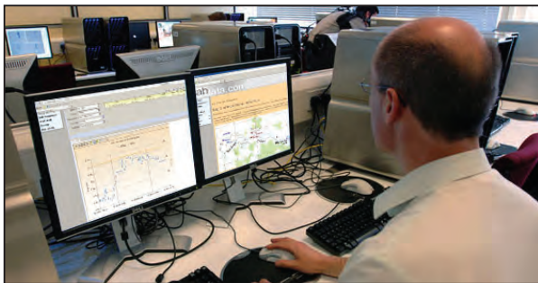
Real-time data easily accessible from any device.

The WQ-PAD monitors up to 23 critical parameters for water quality in real-time, including turbidity, conductivity, pH, depth, temperature and more, so you'll know specifically how and where to improve and manage your water resources.